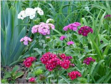
Sweet William – perennial. 12"-18" tall. Sweet scented cut flower.