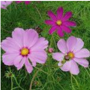
Sensation Blend Cosmos – hardy annual. 3 – 4’ tall.