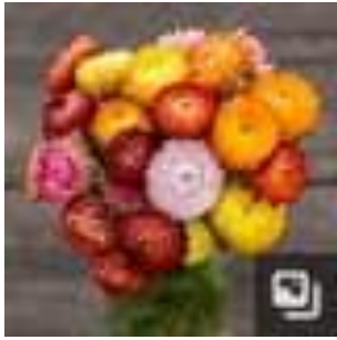
Roggli Riesen Strawflower – annual. 30-36” tall. Great for drying.