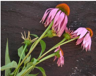
Purple Echinacea – perennial. 24”-36” tall. Drought resistant. Medicinal.