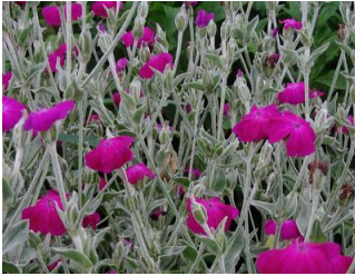
Rose Campion – biennial. 32” tall. Cut flower. Self-sows.