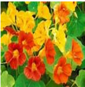
Dwarf Jewel Nasturtium – tender annual. 12-24” tall. Edible flowers.