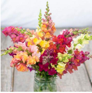
Lion's Mouth Snapdragon – perennial. 12"-24" tall. Cut flower.