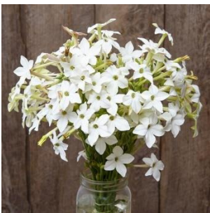
Jasmine Scented Nicotiana – annual. 24”-36” tall. Blooms in evening.