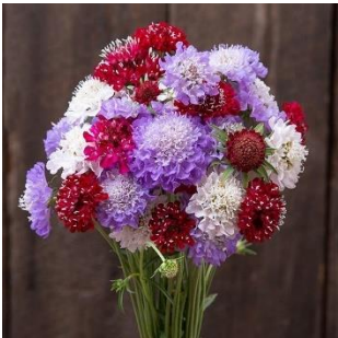
Dynamic Scabiosa – tender perennial. 24”-36” tall. Cut flower. Pollinator attractor.