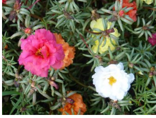
Portulaca – annual. 6” tall. Drought resistant. Bears until frost.