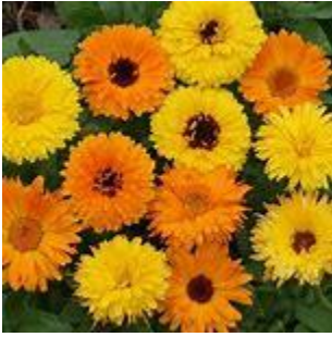
Pacific Beauty Calendula – annual heirloom. 12 – 24” tall. Prefers cool conditions.