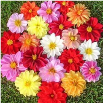
Unwins Dahlia – tender perennial. Short stemmed. Easy to grow.