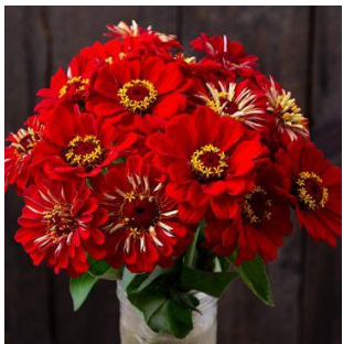
Red Scarlet Zinnia – annual. 30”-36” tall. Cold tolerant.