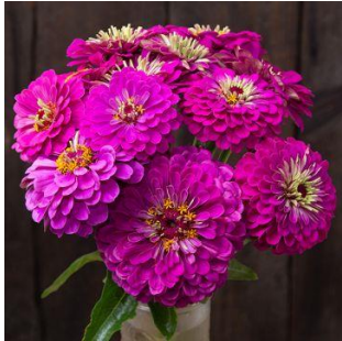
Giant Purple Zinnia – annual. 40”-50” tall. Heat tolerant. 4”-6” blooms.