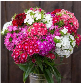
Volcano Mix Dianthus – tender perennial. 20”-24”. Cut flower. Edible petals.